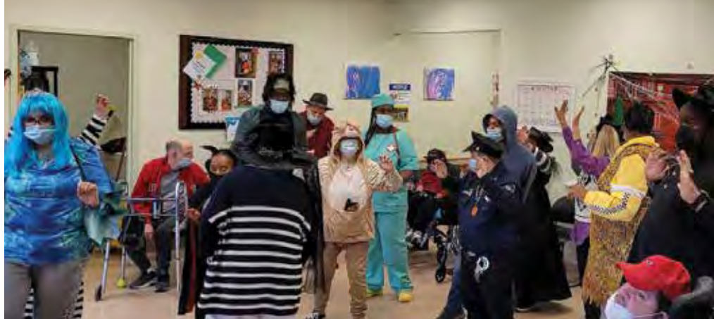
The Day Hab team enjoy a little Halloween festivities the Friday before Halloween.

The Arc of Greater Brockton Day Habilitation Program is pleased to once again offer a variety of community inclusive outings. With the many changes in individuals' routines and access to activities as a result of the Covid-19 Pandemic it is a welcome change to be able to connect with the community once again. Participants were able to enjoy DW Field Park and have frequented local businesses and establishments since state and federal restrictions were eased.