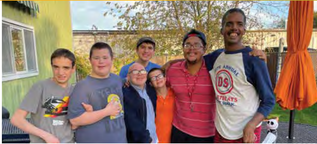
Members of the Young Men's Group enjoy some camaraderie during a recent outside activity.

The Family Support Center Team has been very active throughout the Covid-19 Pandemic – helping families cope with the isolation and financial constraints in a variety of ways throughout the region.