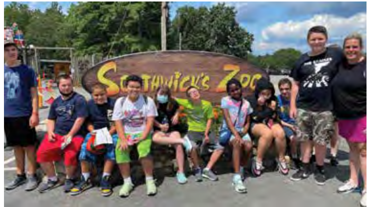
A summer day trip to the Southwick Zoo was organized by the Family Support Recreation Team