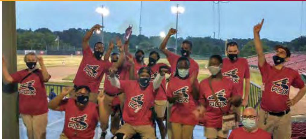
Participants celebrate another successful work day at the Brockton Rox over the summer.

The Employment Services Program has been up and running strong since the Covid-19 Pandemic began. We were able to reopen our Redemption Center in July of 2020 with a slightly different look. We moved all customer operations outside into the parking area, where we continue to help customers today. Our job development program, which helps individuals find employment in the community, has been actively operating as well, including helping those that are ready to return to work.